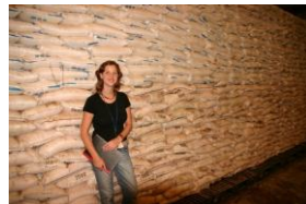
Visit WFP Zambia