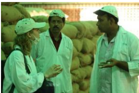
Visit food factory Bangladesh