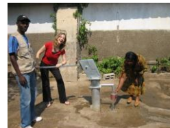
Visit World Vision Zambia