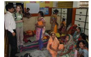
Visit SAJIDA Bangladesh

“You may never know what results come of your action, but if you do nothing there will be no result”