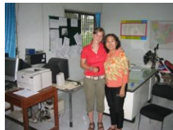
Visit Unicef Cambodia